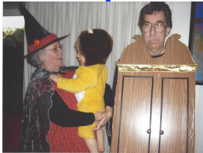
The Witch, the Lion and the Wardrobe